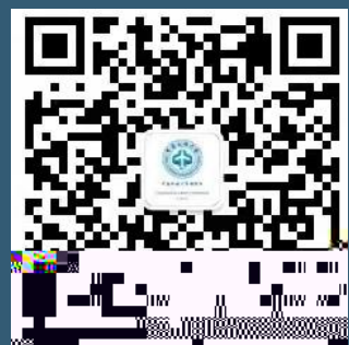
International Affairs Office of CAUC