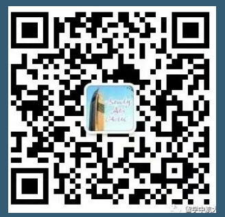
International Students Affairs Management Office of CAUC